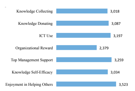
Figure 2: Results of descriptive analysis

The highest score for the enabling factors of knowledge sharing was for enjoyment in helping others. In contrast, the lowest score was for organisational rewards.